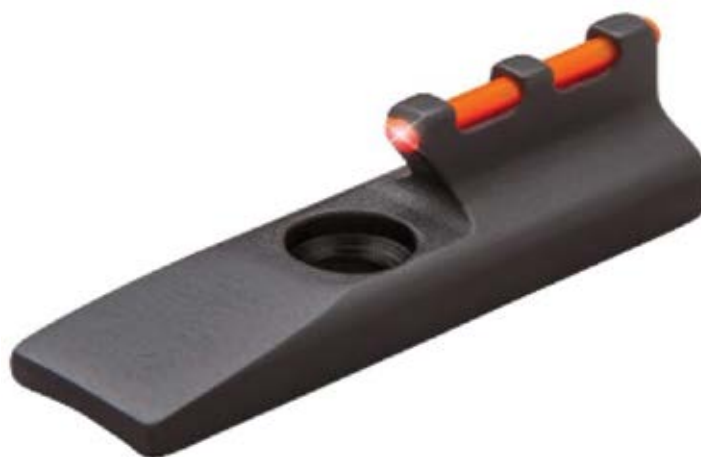
^ Are fibre optic front sights allowed in Service Pistol, SP unrestricted and WA1500?