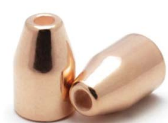
^ A competitor was disqualified for being deemed to have used full jacketed projectiles. The competitor was using a copper plated projectile...

Most of the queries that come my way are fairly straight forward – but I am very pleased that people are asking these questions and not just using guesswork for the answers. ♦