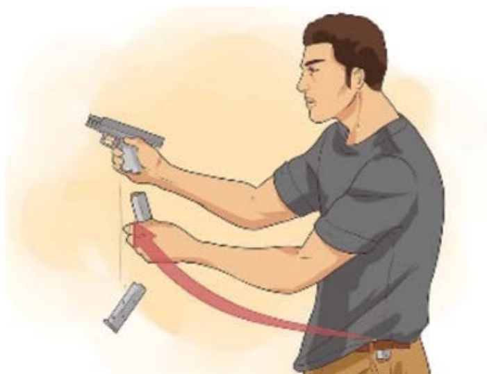
^ When using an Auto pistol would the rules be breached if the 12 rounds were split into 7 rounds in one magazine and 5 in the other?